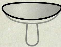
FLAT OR EFFUSE